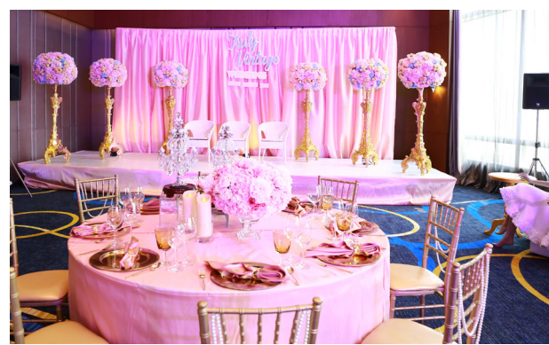
M<sub>23</sub> THB 280,000