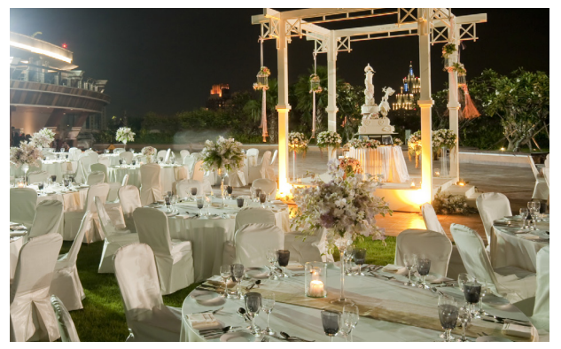
Lotus Garden / Lotus Suite THB 350,000