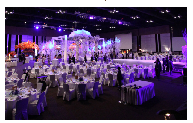
Convention Centre THB 1,500,000